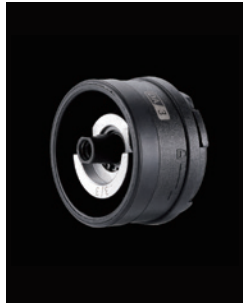
3mm Orbital sanding/polishing head(DA3)