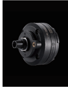
High-torque rotary polishing head(RO-L)