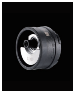
12mm Orbital sanding/polishing head(DA12)