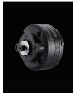
High-torque rotary polishing head(RO-L2)