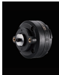
High-speed rotary polishing head(RO-H)